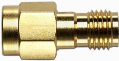
Model 72967 SMA JACK (F) / JACK (F), REVERSE POLARITY

High bandwidth, small size, and durability for confident connections